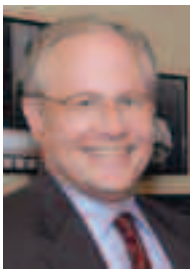
William Kristol , lecturer in public policy, taught a course with the title Can America Be Governed?

Politics and Public Policy. In this course students examine the lessons that can be learned from recent news coverage of such topics as the war on terror, the war in Iraq, the 2004 election, and the current political situation.