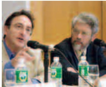
Ira Flatow and John Holdren

The Shorenstein Center contributed to the Kennedy School's annual spring conference on May 5 by hosting a panel discussion titled "The Role of the Media in the Discussion of Global Warming." The panel fit into the larger theme of the conference, titled "The Looming Crises: Can We Act in Time?" The two-day conference was designed to explore areas where change is critical to avert large-scale public crises.