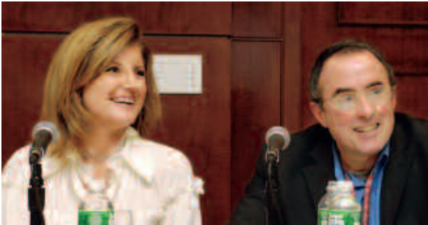
Arianna Huffington and Michael Kinsley

On Friday, October 13 and Saturday, October 14, the Shorenstein Center marked its twentieth year of exploring the intersection of press, politics and public policy through vigorous debate and research.