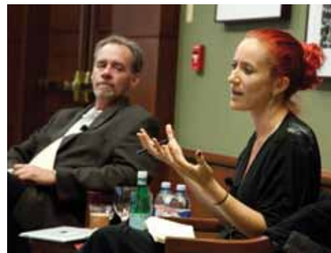
New York Times columnist David Carr spoke with Danah Boyd, senior researcher for Microsoft Research.