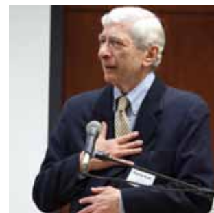
Marvin Kalb, the Shorenstein Center's founding director, reflected on 25 years.